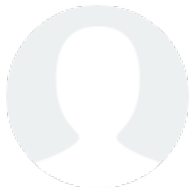
Scott Resource One Realty, LLC