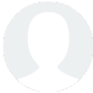
Tiffany Coldwell Banker Real Estate Group