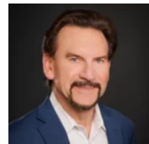
Frank Adashun Jones, Inc.

EXCELLENT BUILDING SPACE IN SE AREA NEAR HWY 41 AT PRESENT – APPX 10, SF. WELL MAINTAINED PROPERTY. DNR PHASE II ACCEPTABLE.