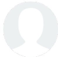
Jason Zellner Real Estate