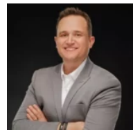
Scott Adashun Jones, Inc.