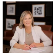
Jan Adashun Jones, Inc.