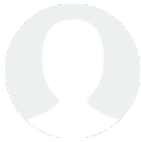
Sean Province Builders & Realty, Inc.