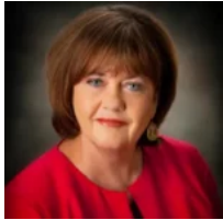
Vickie Adashun Jones, Inc.