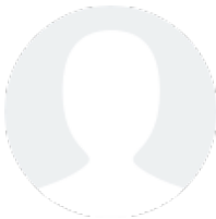
David Ruesch Realty