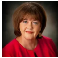
Vickie Adashun Jones, Inc.