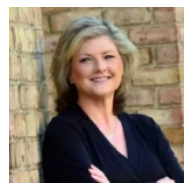
Vicki Adashun Jones, Inc.