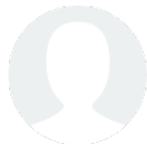
Elaine First Weber, Inc.