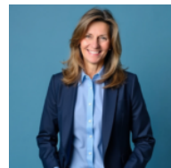
Gail Adashun Jones, Inc.