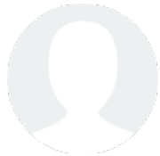
James Roberts Homes and Real Estate