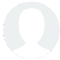
Mike Acre Realty, Ltd.