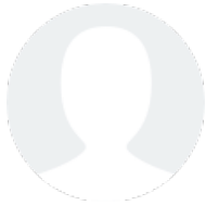
Aaron Curran Real Estate, LLC