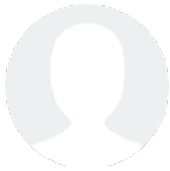
Jami Trimberger Realty, LLC