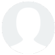
Malinda Trimberger Realty, LLC