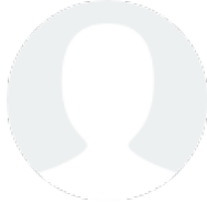
Jami Trimberger Realty, LLC