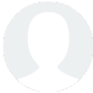
Jessica Design Realty