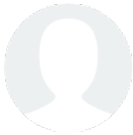
Mike Acre Realty, Ltd.