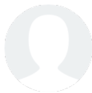
David Roberts Homes and Real Estate