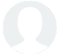
Robin First Weber, Inc.