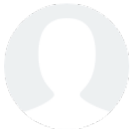
Jordan Beiser Realty, LLC