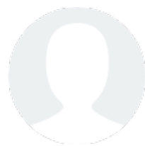
Shane Renard Realty