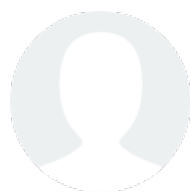
Shane Renard Realty

Build your dream home on this corner lot. Currently has been approved for a duplex, but can build a single-family home as well. Last lot available in the subdivision.