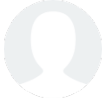
Andrew Best Built, Inc.