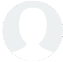
Andrew Best Built, Inc.