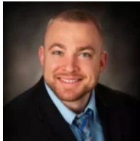
Steven Adashun Jones, Inc.