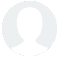
Aaron Curran Real Estate, LLC