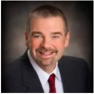
Terrance Adashun Jones, Inc.