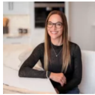
Jodi Adashun Jones, Inc.