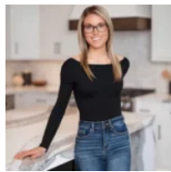
Jada Adashun Jones, Inc.