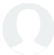
Kent Jason Gerhard & Associates Real Estate