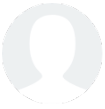
Andrew Best Built, Inc.