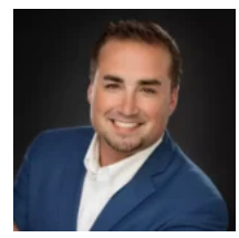
Kevin Adashun Jones, Inc.