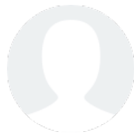
John Coldwell Banker Real Estate Group

It is a good starter home or investment property located in the city of Shawano. The property has a main floor primary, 2 bedrooms upstairs with a large landing, a 5x7 back entry/mud room, a storage shed, and a cement driveway. All offers will be reviewed Monday, 03/17/2025, at Noon.