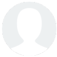
Tim Besaw Properties, Ltd