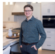
Glenn Adashun Jones, Inc.