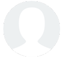
Josh Acre Realty, Ltd.