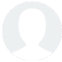
Josh Acre Realty, Ltd.