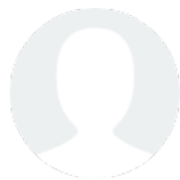
Josh Acre Realty, Ltd.