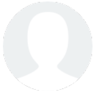
Tiffany Coldwell Banker Real Estate Group