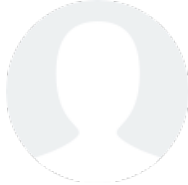
Kim First Weber, Inc.