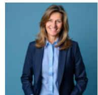
Gail Adashun Jones, Inc.