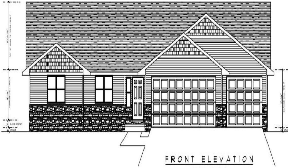
SCALE: 1/4" = 1'-0"

6500 DEUSTER Road, GREENLEAF, WI, 54126-0000