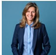
Gail Adashun Jones, Inc.