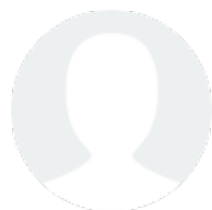
Bob Beiser Realty, LLC