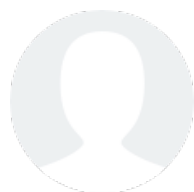
Dennis M. Beiser Realty, LLC