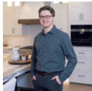
Glenn Adashun Jones, Inc.