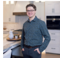
Glenn Adashun Jones, Inc.