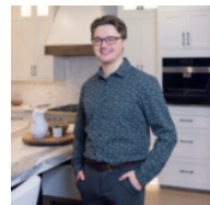
Glenn Adashun Jones, Inc.