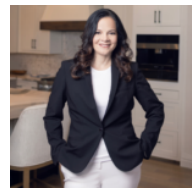
Sarah Adashun Jones, Inc.