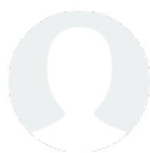
Jason Coaction Real Estate, LLC